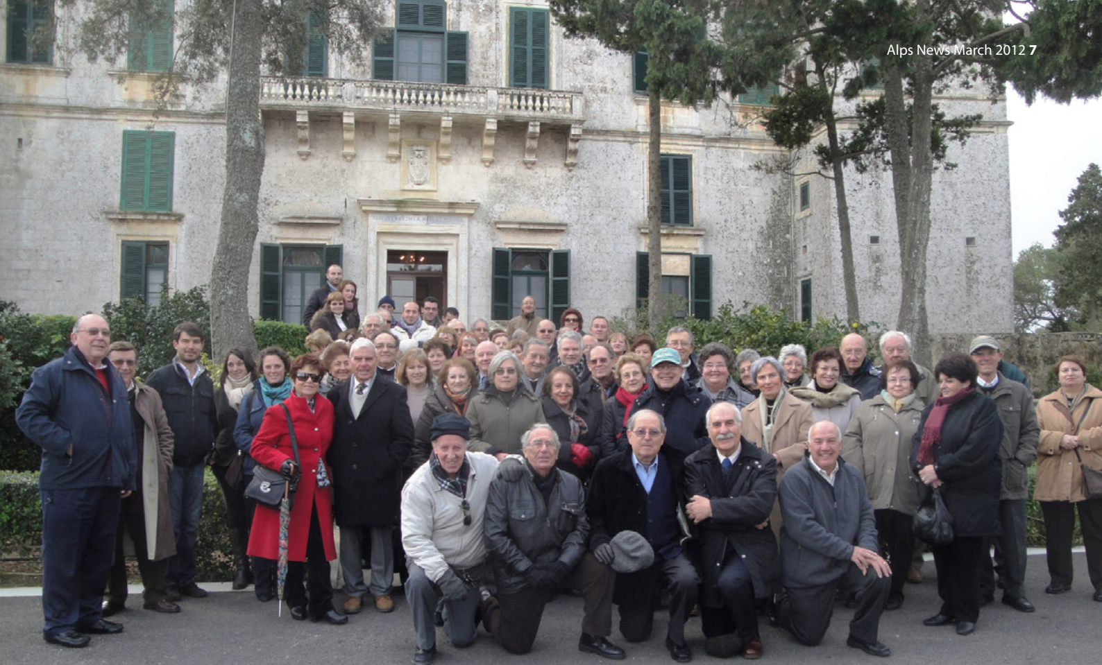
A.L.P.S. GROUP PHOTO OF THE VERDALA PALACE CULTURAL TOUR