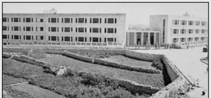
Lyceum Inauguration Photo - 1958