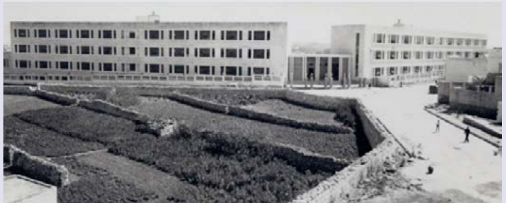
The Lyceum, Hamrun - Inauguration 9th April 1958

At 7 o'clock sharp I boarded the bus with my four friends from the village main bus terminus towards Valletta. In just 30 minutes we descended at Valletta