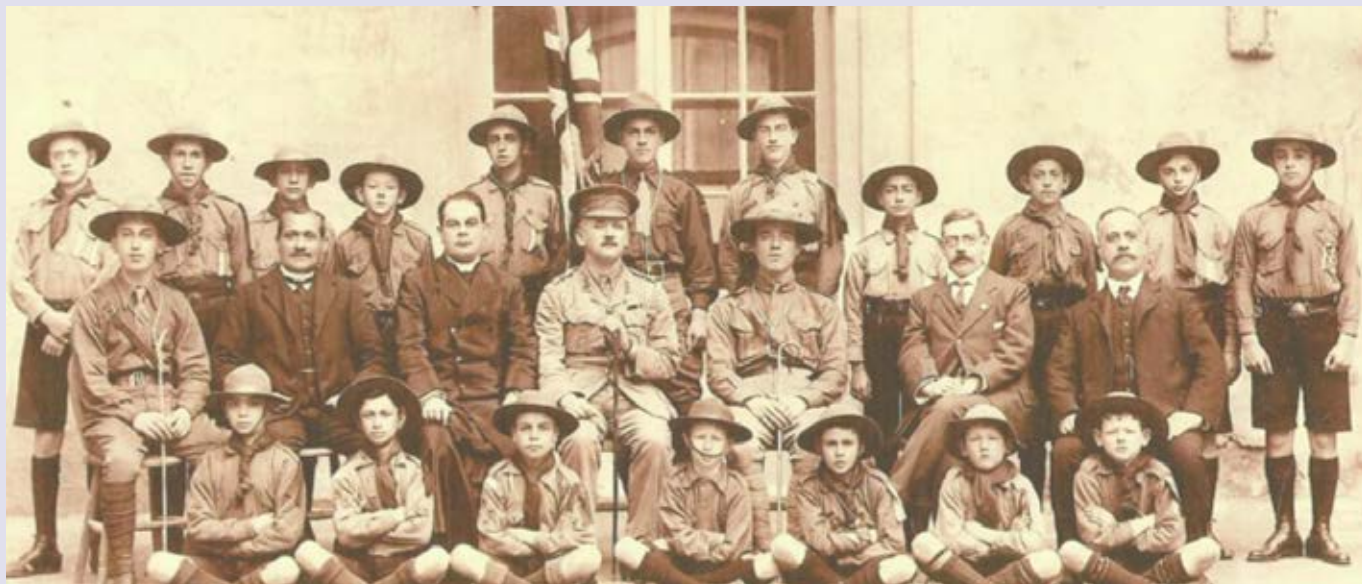
The committee and The Lyceum Scouts Group - 1914