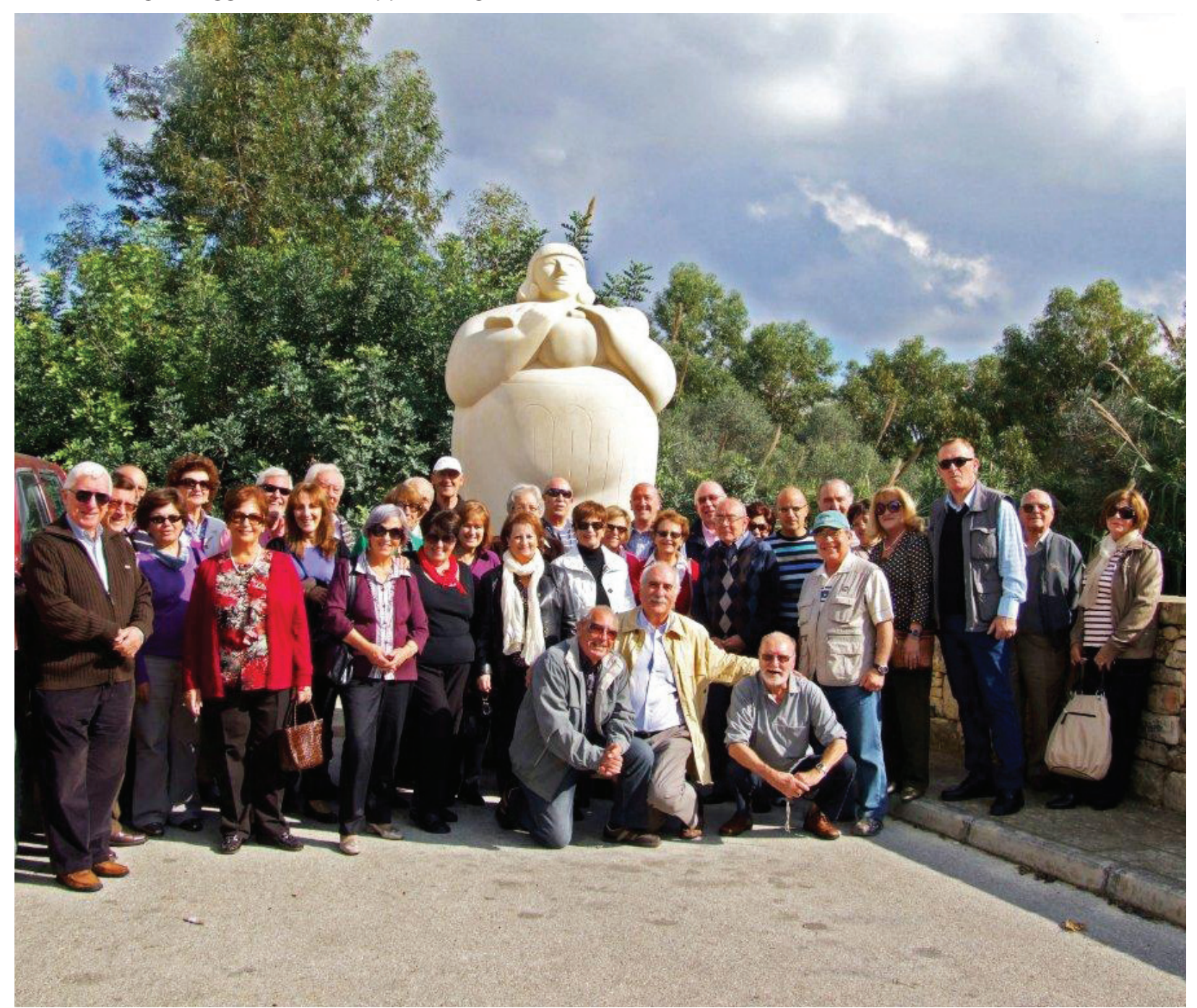
Group photo: Alps Cultural tour, Safi and Siggiewi during November 2012